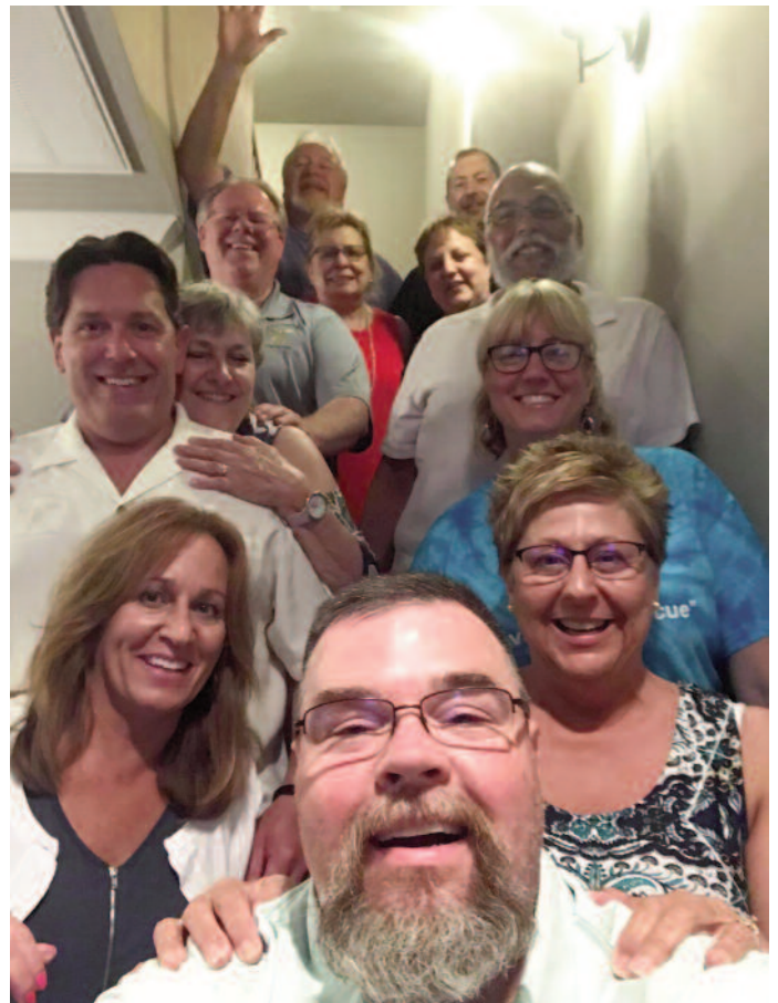
Beja attending the 2019 Imperial Session