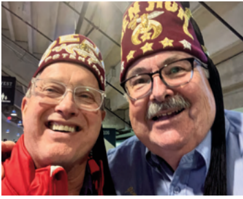
Beja Members Having Fun Helping Kids!