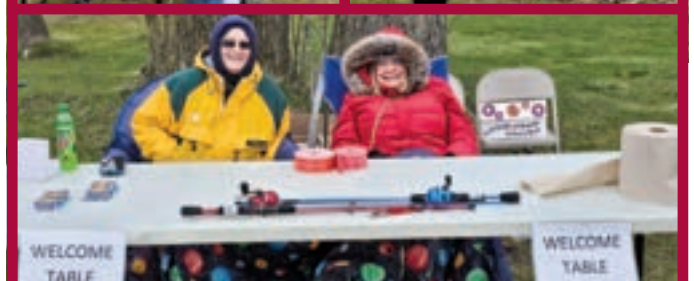
BEJA SHRINERS VOLUNTEERING AT THE SUAMICO KIDS FISHING DAY ON APRIL 20th