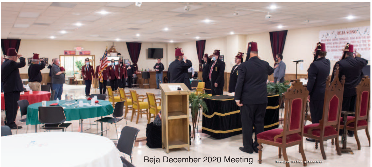
Beja December 2020 Meeting