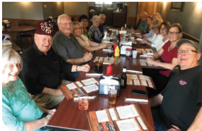
The Oconto County Shrine Club enjoyed fine food and excellent company at Wouters Front recently.