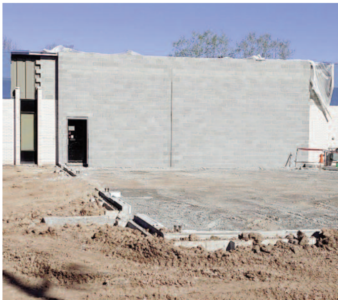
Beja Shrine addition update. The firewall has been completed!