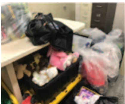
A snap shot of our new work room at the clinic