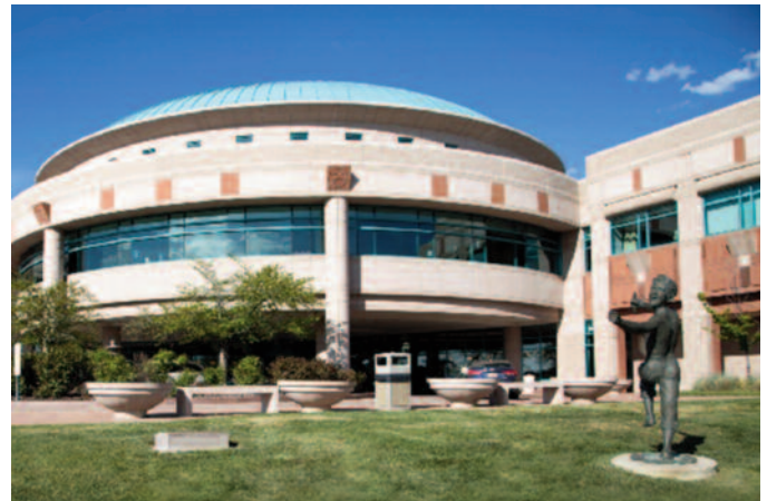
Shriners Children's – Salt Lake City