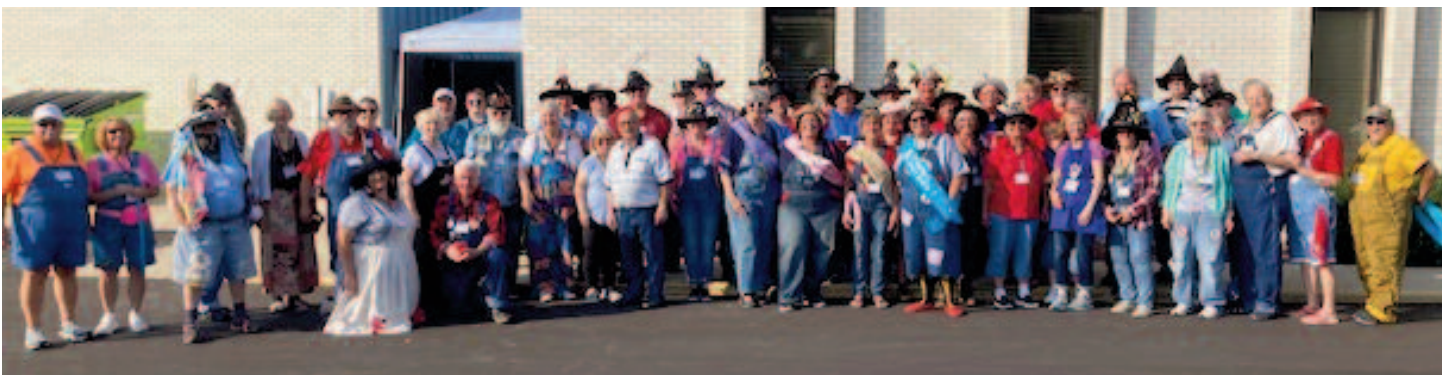
Above: some of the attendees to the 41st International Hillbilly Convention.